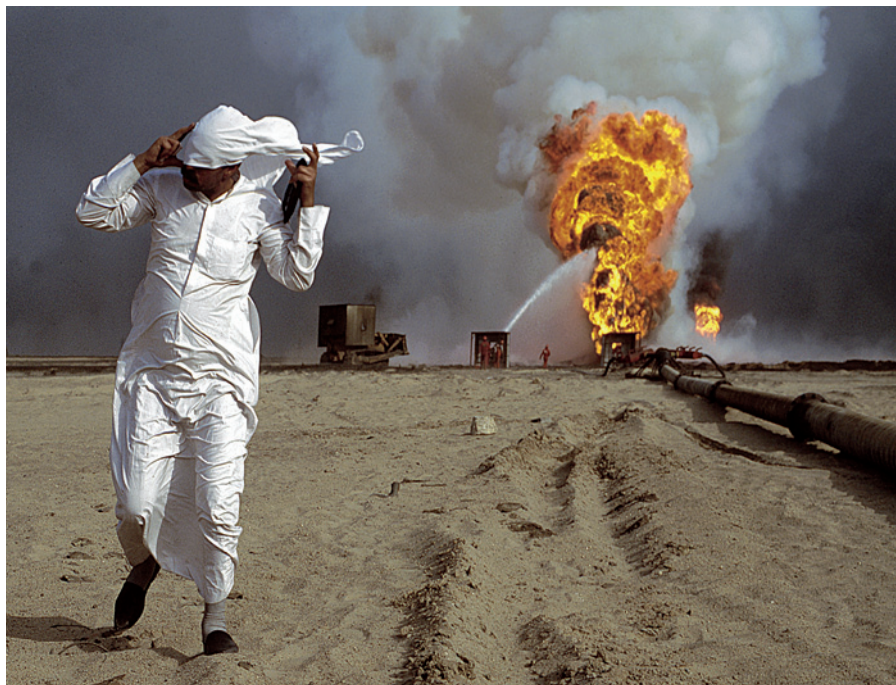
Oil supplies have remained steady for 40 years despite disruptions such as the Kuwaiti well fires in 1991.